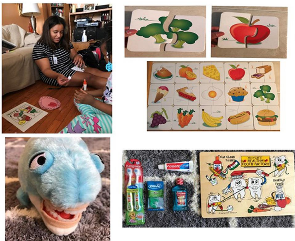
Figure 1. Child-focused oral health education. CHW-led oral health interventions for children incorporated interactive, play-based activities designed to teach topics such as proper tooth brushing techniques and healthy dietary habits.

When barriers to delivering oral health education were identified, CHWs guided caregivers in applying relevant self-management skills and developing an Action Plan. Families created lists of problems, which informed their Action Plans. At subsequent home visits and follow-up calls, CHWs reviewed previous Action Plans, revising them or creating new ones as appropriate. When children were present, CHWs engaged them in oral health education through interactive games and activities ( Figure 1 ). There was also the option to record clinical observations, such as visible cavities, fillings, white spots, or enamel defects, based on CHW and family comfort. CHWs documented their observations in journals after visits; entries were maintained without linking to participant identifiers.