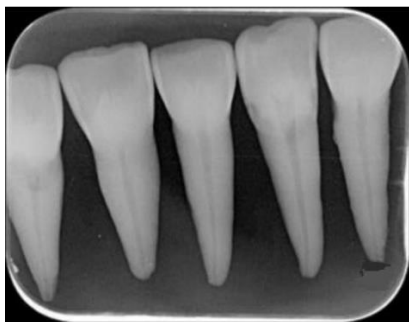
Figure 1. Examining the root canal anatomy of teeth with parallel periapical radiography.

In this in vitro study, teeth with similar lengths and root canal anatomy were selected. A parallel radiographic image was used to examine the anatomy of the root canal ( Figure 1 ).